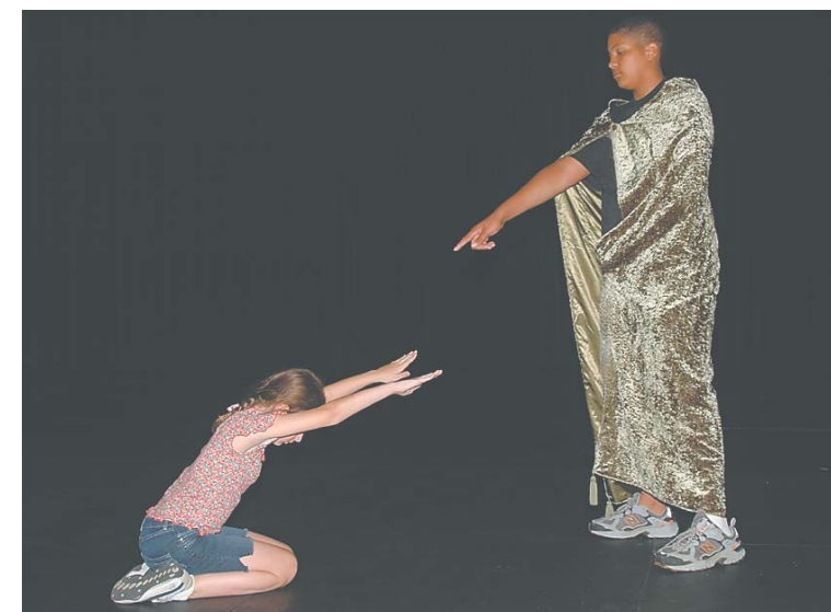
Two actors rehearse in theater camp.